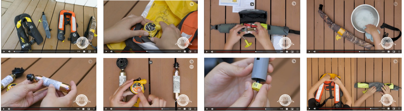
Video vignettes from above website

https://www.dvidshub.net/video/714787/inflatable-life-jackets-everything-you-need-know-9-min