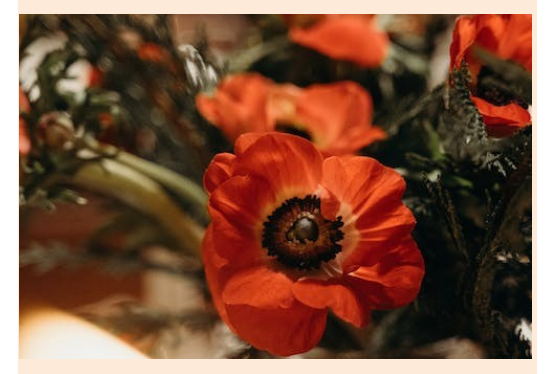
Flower of August: Poppy