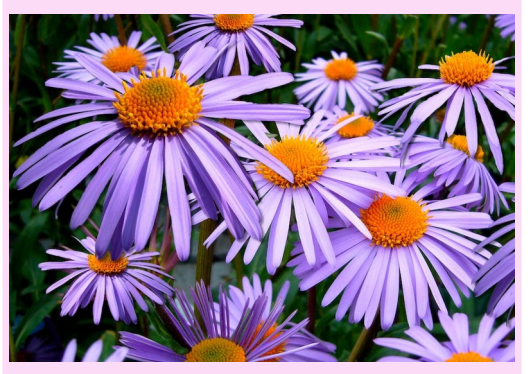
Flower of September: Aster

"By all these lovely tokens, September days are here, With summer's best of weather, And autumn's best of cheer." —Helen Hunt Jackson