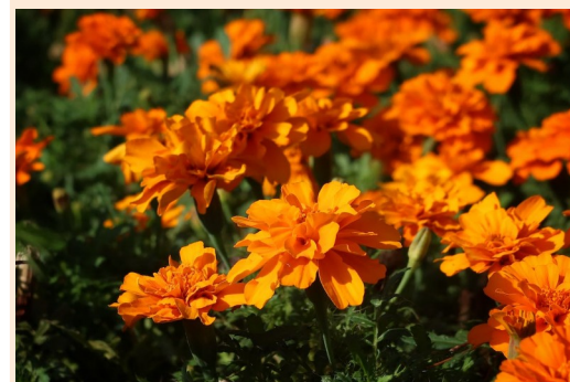
Flower of October: Marigold