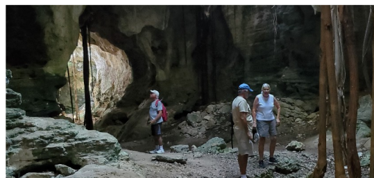
Hiking at Hamilton Caves Long Island