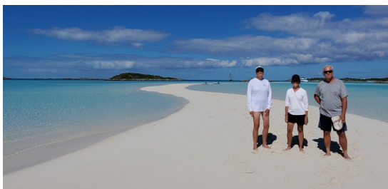
Walking the waters of Wardrick Wells at low tide