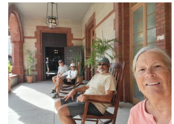
Sitting on the rockers on the grounds of Flagler College, St. Augustine FL