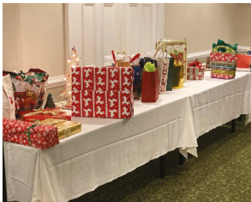
Ready for the Broken Rudder Gift