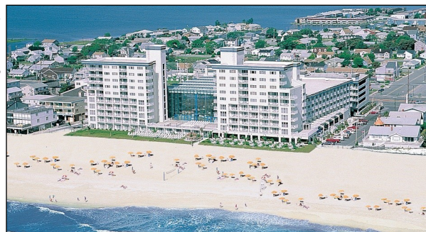
Princess Royale in Ocean City MD

If you have any questions or concerns call me (757)681-5897 or email: agaenterprises1@gmail.com .