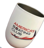
Stemless Wine Glass

Have product questions? SS Staff will be available during certain hours. (Check Agenda for details, dates, and times.)