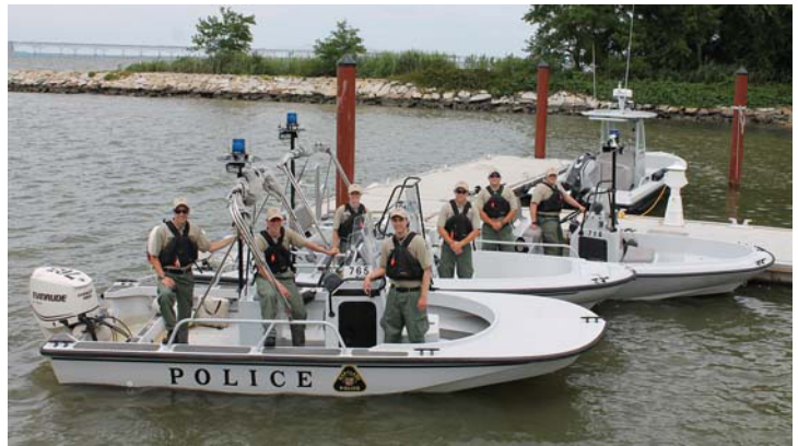
MD State Police heading out on patrol