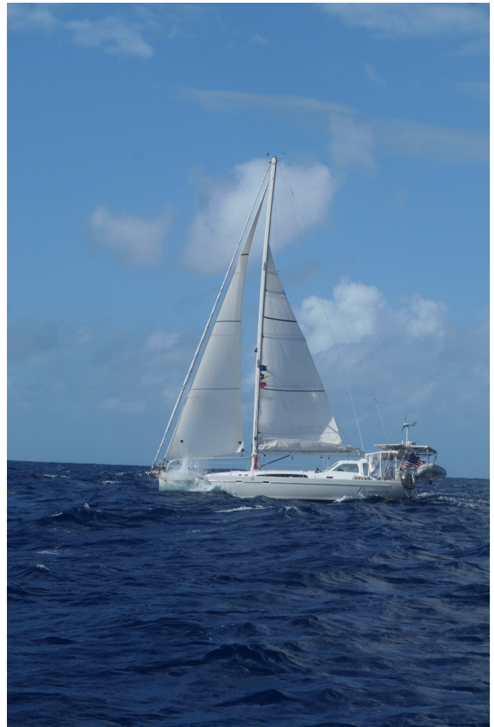
Pandora under sail

That is the playbook today. A few years ago, sailors