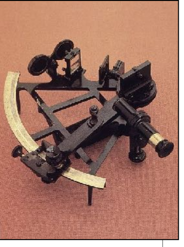
Using a sextant can take some practice.

June 9, no classes will be held for the balance of the summer to give the students time to take their required sights and complete the required sight folder. The N classes will resume on Tuesday, Sept. 8, for 10 sessions.