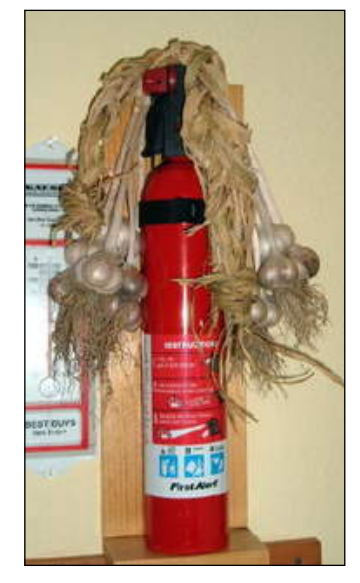
What's wrong with these braids of garlic? How many things can you name?

• If you meet a minister before sailing, turn around and go home.