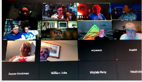
Squadron members connected via Zoom for our May monthly meeting. Page 10.

Let me know if you have any problems accessing various hyperlinks throughout this issue. <u>lapnews@gmail.com</u>