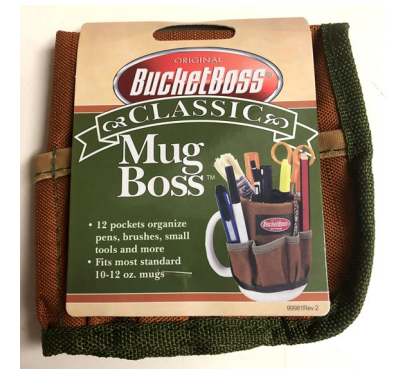
Gifts for Everyone