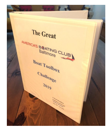
The Boat-less Commander's "Virtual" Tool Box