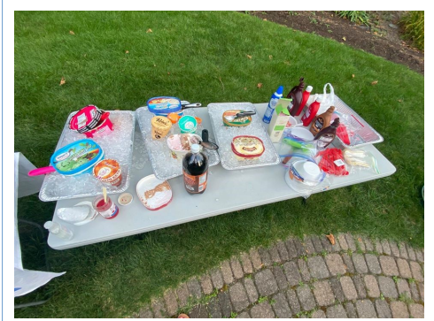
Lots of ice cream choices.