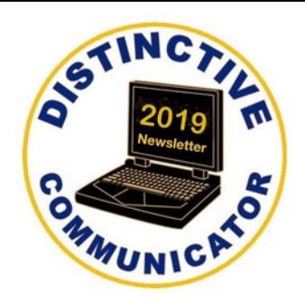
Visit our website here: www.delhigh.org

Be safe, courteous and helpful in all you do. Stay healthy and most of all have fun.