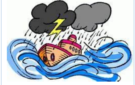
We avoided the morning thunderstorms and only met for an afternoon BBQ.