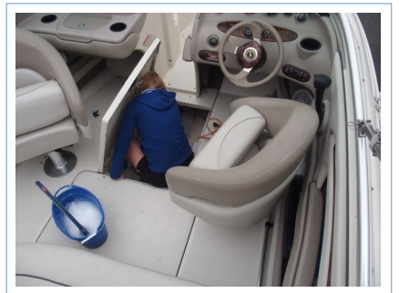
Kathleen cleaning the ski locker.