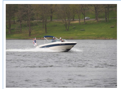
Last Call in the water at Blue Marsh Lake.