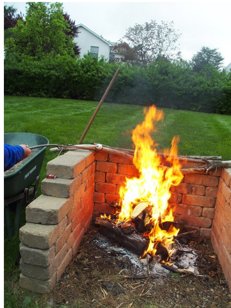
The fire burning all our socks.