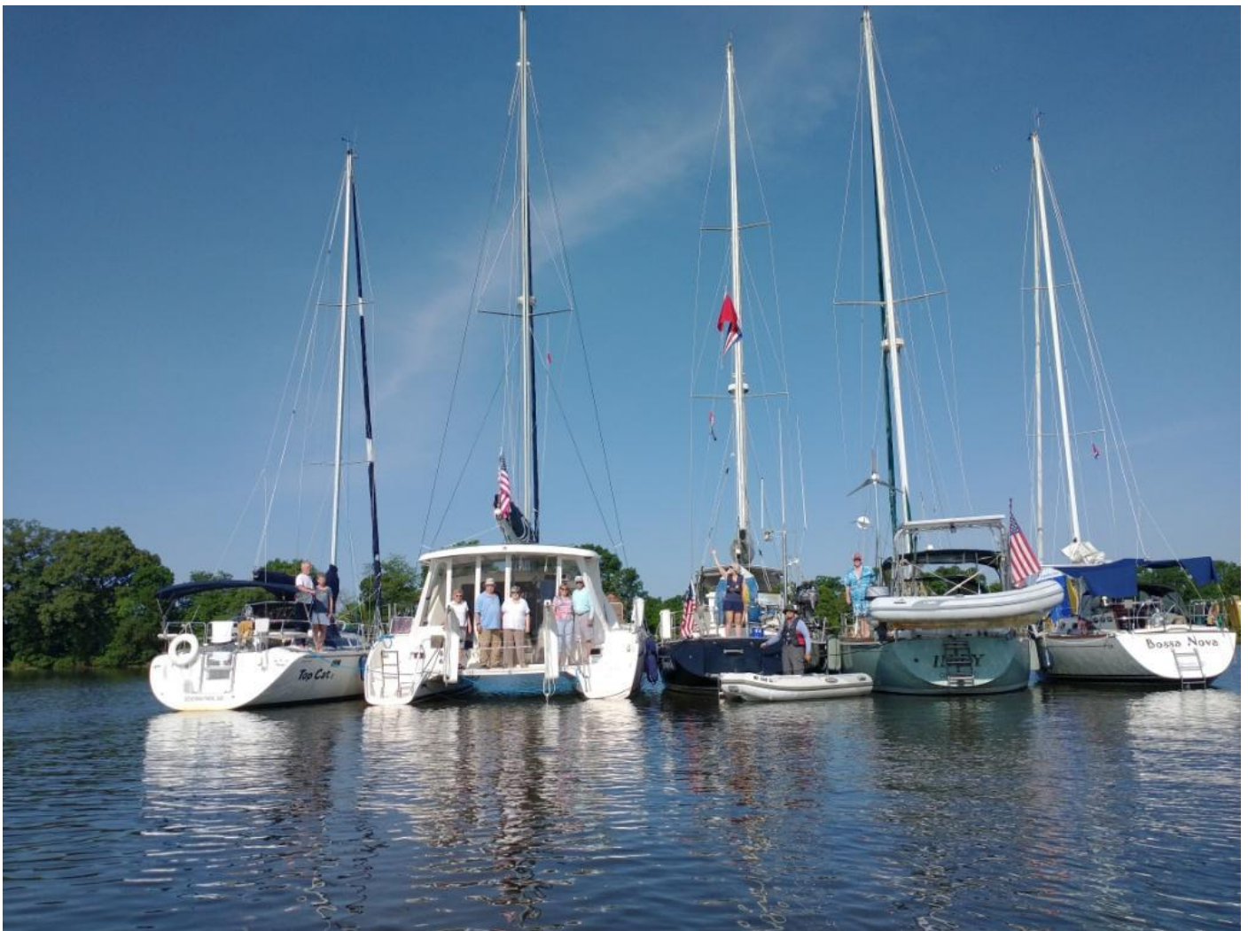
LUX on a raft-up on the Chester River in May 2022.