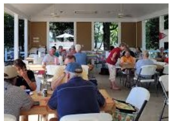
Saturday Night dinner will be in the pavilion overlooking the marina!