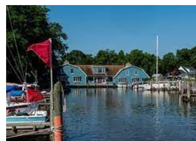
Lankford Bay Marina - Beauty and Serenity on the Eastern Shore!

Just want a quiet weekend? Don't worry. We have that covered as well. Beyond the Summer Council meeting, you'll be able to play lawn games, attend a seminar, or swim in a beautiful pool overlooking Lankford Bay.