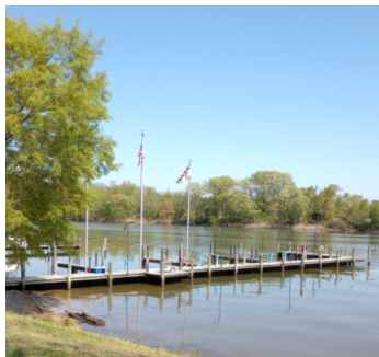
Saturday — Flag Raising at 900.

Use this agenda to make sure you don't miss anything at Summer Council!