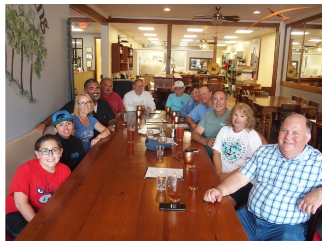
Rainy day alternate activities...