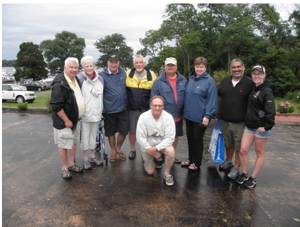
Past commanders surrounding our current commander in order of year served