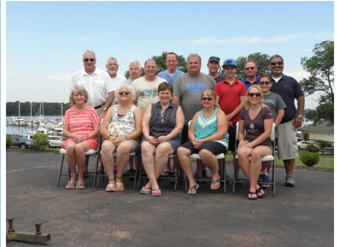
Delhigh members getting in one last group photo before heading back toward home.