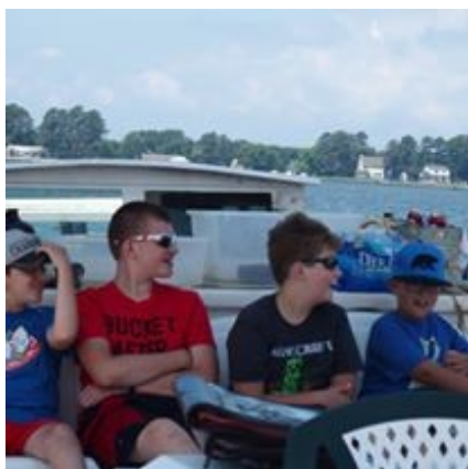
Nowroozani boys and friends