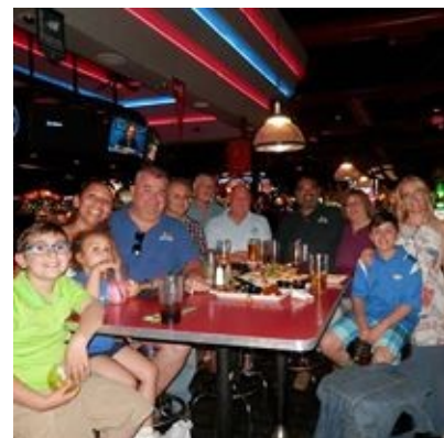
The Delhigh Gang