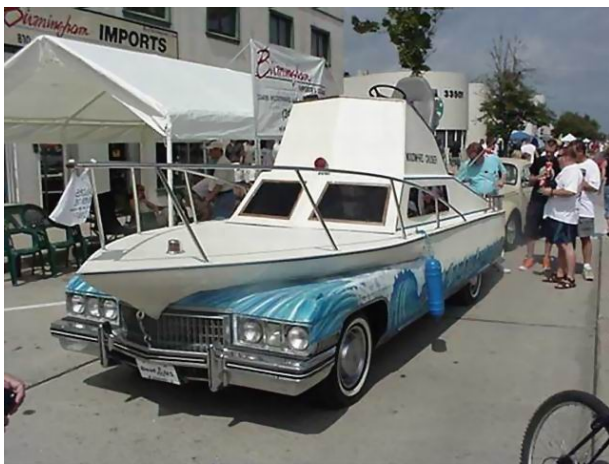
Delhigh's Committee Car