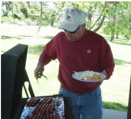
The hot dogs were done to perfection!!