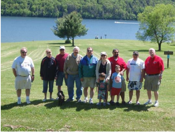
2010 Clean-up Crew