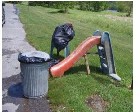
Quite a bit of trash collected