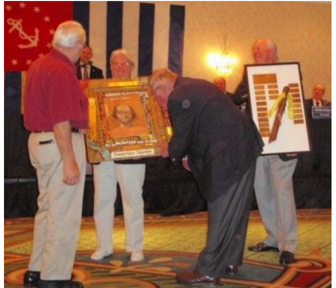
Sourpuss and Broken Mast being authenticated