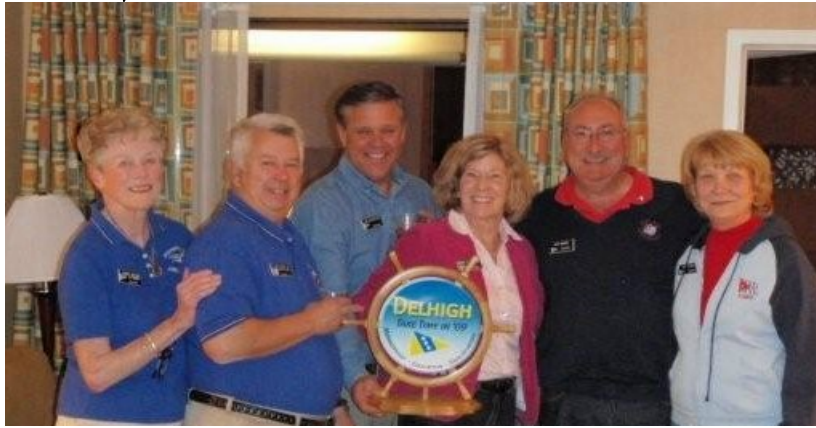
Delhigh's Contingent