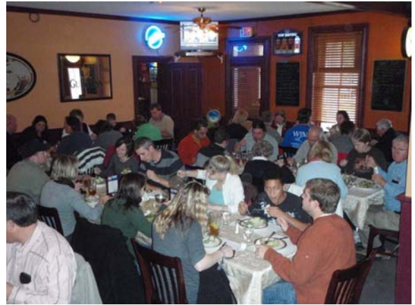
79 participants filled the restaurant for dinner