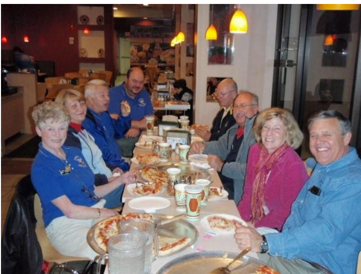
Friday night pizza