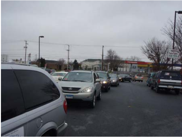
25 cars lined up and ready to go