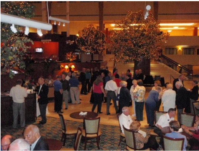
Friday Night Meet and Greet—Hilton Lobby