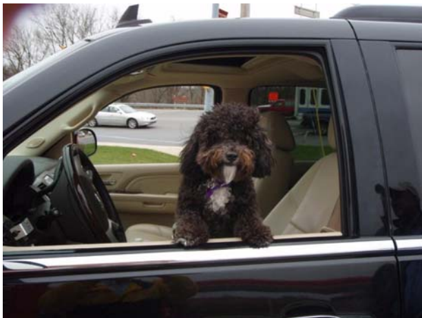
Nikki checks to see that everyone made it back ok