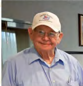
Benjamin H. Sooy III, AP