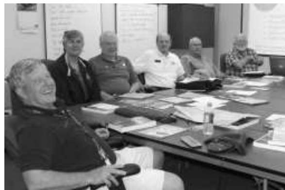
Cooperative Charting Workshop - May 2008