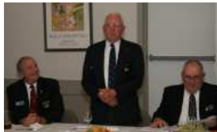
A new squadron formed.