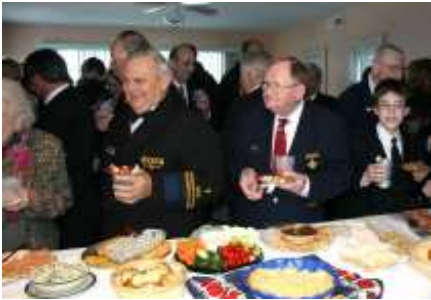
Many cocktail parties enjoyed,