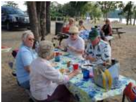
Much food eaten, and