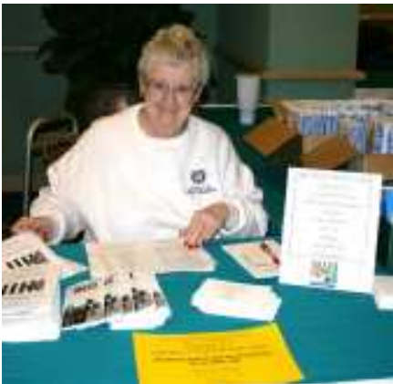
Friends registered for a conference